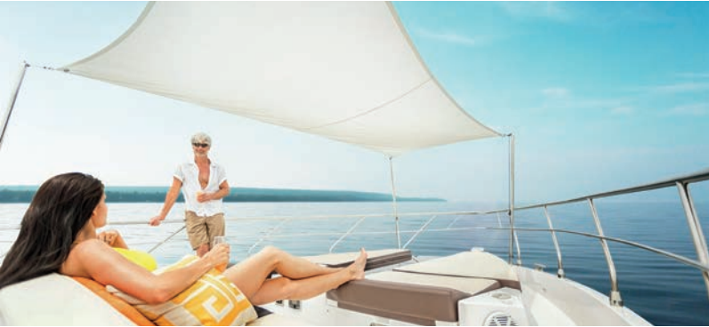
COCKPIT AND FOREDECK Entertaining options complete with grill, sun shades, and convertible seating for whatever format suits your mood