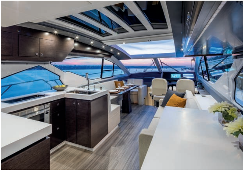
UPPER SALON one level for entertaining and piloting comfort • dining for 4-6 galley with dishwasher, icemaker and bottle storage conveniently at hand • sun-roof opening is largest in its class