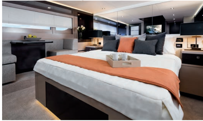
MASTER STATEROOM – Single Level, No Steps • California King Bed • Large Hull side windows providing ample amounts of natural light • Largest Walk in Master Closet in her Class • Ample Storage with 8 Drawers • Master Head featuring double vanity and stall shower